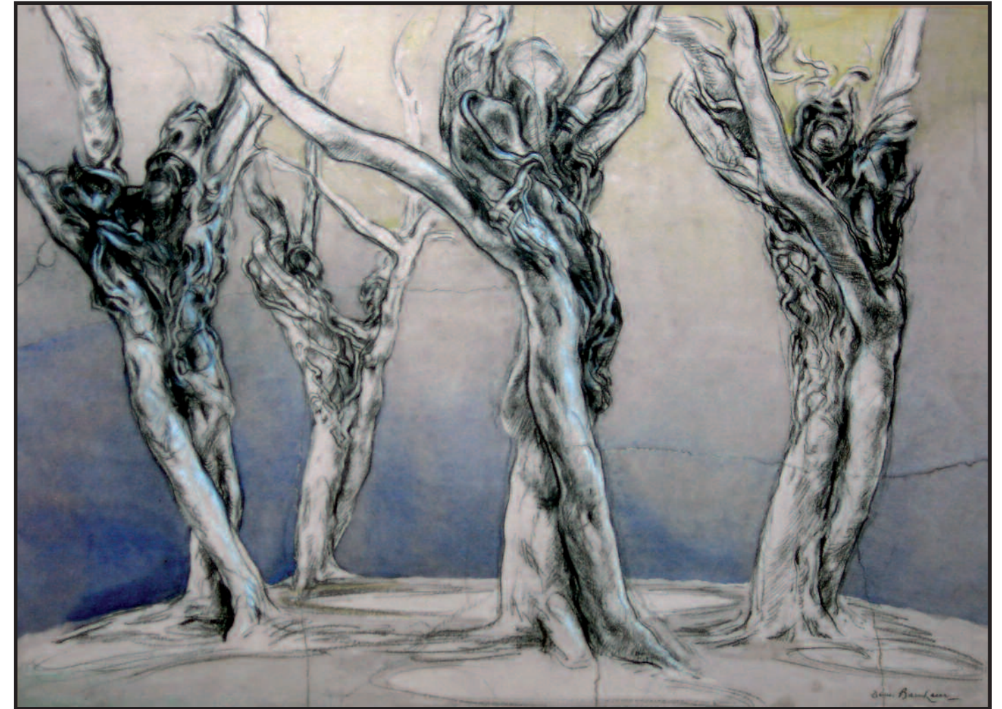
La Ronde (Circa 1956)