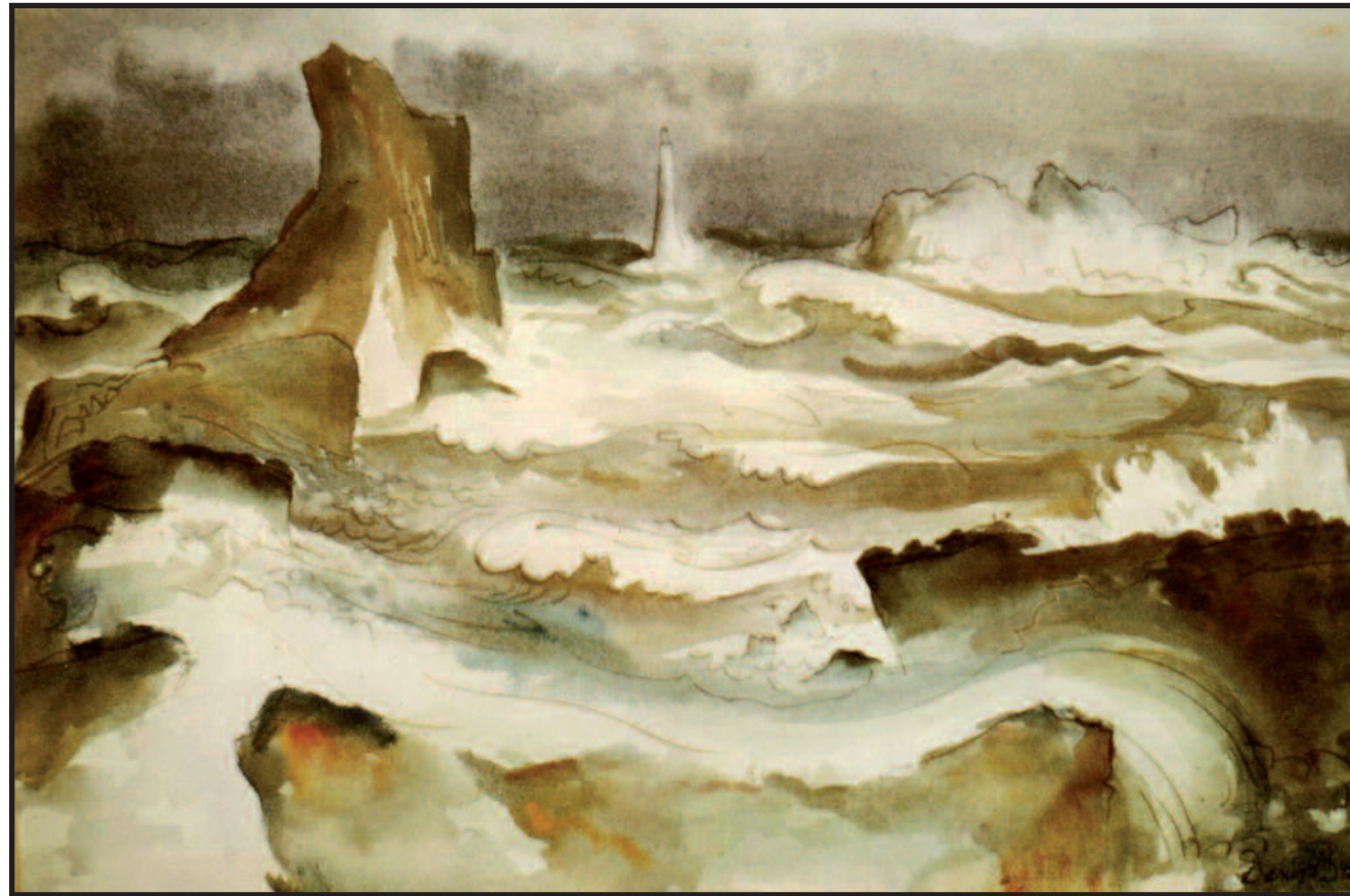
Storm and Lighthouse, Guerneville (1948)

Here are five other splendid examples of work by the very talented former Head of Art, who taught at Epsom from 1947 to 1971