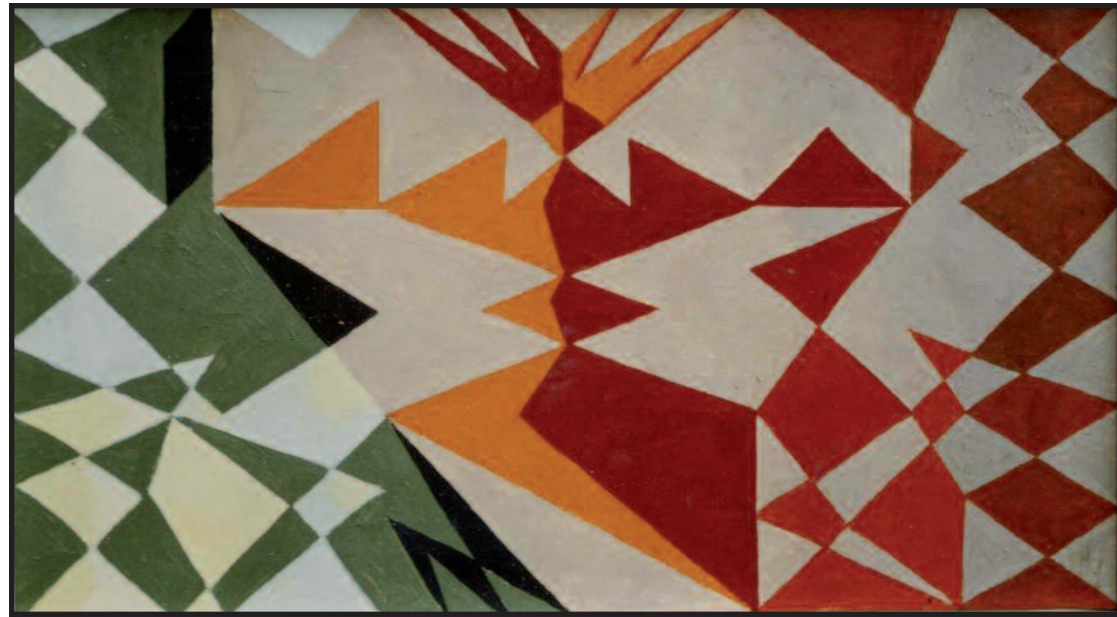
The Dominant Queen (1974)